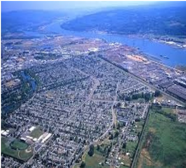
Arial of Longview, WA

Washington Environmental Council wecprotects.org