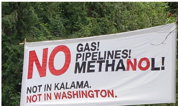
Photo from May 18 th , 2019 No Methanol Rally, Camp Kalama