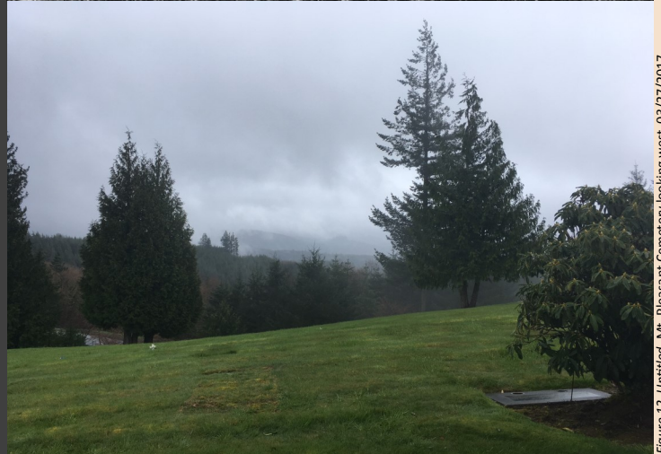
Figure 12. Untitled. Mt. Pleasant Cemetery looking west, 03/27/2017.